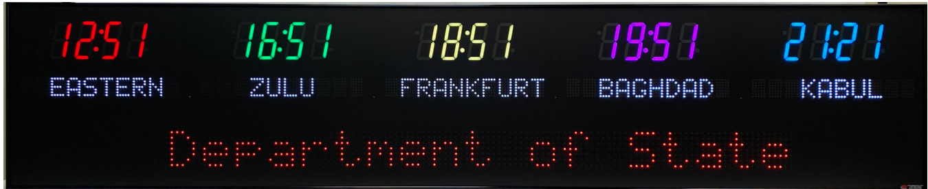
Model 6619L - 4.0" time, 2.0" zone labels, 5 zone with a 72" wide 4.0" tall Color Message Display

The 6619 series time zone clocks have user changeable multi-color bar segment LED time displays with a ten character user changeable multi-color dot matrix digital zone label below & a seven color moving message display. A single line message display has a 2 inch or 4 inch character. In many 6619 models, the clock can display up to 24 time zones through page flipping. For Example, a six zone clock can show four pages of time zone information. Likewise, a four zone unit can show six pages.